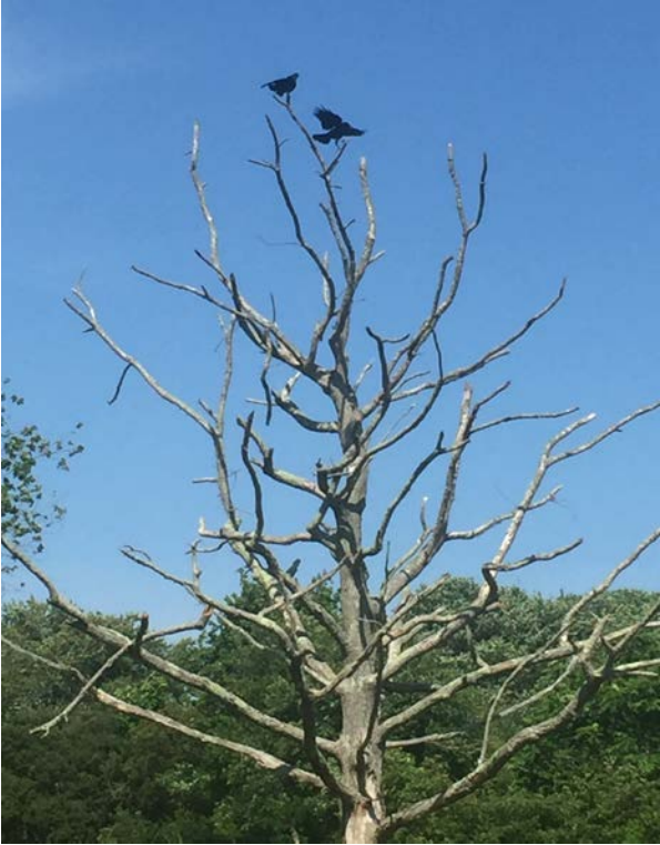
One secure, one not so sure, in a beachside bluster...below, wild pea flourishes in a salt Atlantic breeze. ...Photos: Hugh Kelley